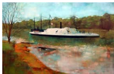
CSS Jackson w/Brooke Rifled Cannons

in the South was to create Confederate Navy ships to negate the US Navy efforts from the rivers and bays in the South. A large Navy construction yard was built in Columbus, GA, but the first efforts to defend the Chattahoochee River was the creation of a small Navy Yard in Saffold, GA and begin construction on a wood gunboat. This presentation will go into further detail on all these issues and include images of many of these sites and ships. The