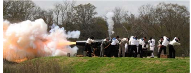
Firing a CSS Jackson Brooke Rifle

With the coming of the War in April, 1861, it was obvious that keeping lifelines open from the Confederacy to those who could potentially help from the outside was going to be critical. One of those lifelines was from the Chattahoochee/Flint River system in the deep South which exited into the Gulf of Mexico at Apalachicola, Florida. A major market route for cotton and mill goods from Alabama and Georgia. One blockading ship arrived off Apalachicola in June of 1861 and then two by August. One way to keep all the river ways open