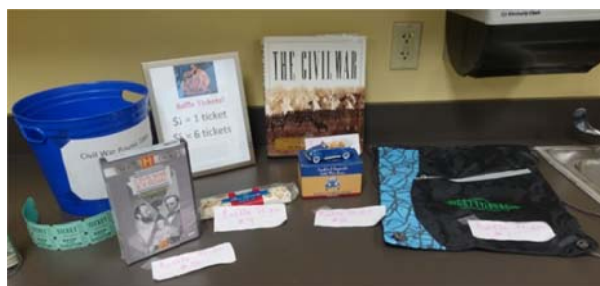
Typical of Monthly Raffle Items at each Meeting