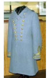
Catesby Jones Jacket, CSS Jackson

in the South was to create Confederate Navy ships to negate the US Navy efforts from the rivers and bays in the South. A large Navy construction yard was built in Columbus, GA, but the first efforts to defend the Chattahoochee River was the creation of a small Navy Yard in Saffold, GA and begin construction on a wood gunboat. This presentation will go into further detail on all these issues and include images of many of these sites and ships. The