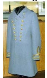
Catesby Jones Jacket, CSS Jackson

into further detail on all these issues and include images of many of these sites and ships. The efforts to raise from the Chattahoochee River both the wood gunboat, CSS Chattahoochee , and the full size ultra-modern ironclad CSS Jackson from the Chattahoochee River will also be discussed.