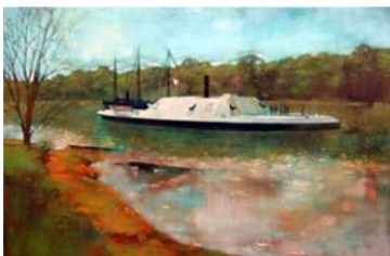
CSS Jackson w/Brooke Rifled Cannons

Georgia. One blockading ship arrived off Apalachicola in June of 1861 and then two by August. One way to keep all the river ways open in the South was to create Confederate Navy ships to negate the US Navy efforts from the rivers and bays in the South. A large Navy construction yard was built in Columbus, GA, but the first efforts to defend the Chattahoochee River was the creation of a small Navy Yard in Saffold, GA and begin construction on a wood gunboat. This presentation will go