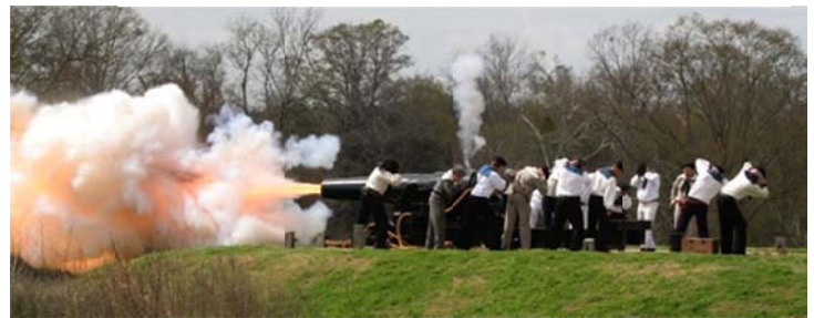
Firing a CSS Jackson Brooke Rifle

With the coming of the War in April, 1861, it was obvious that keeping lifelines open from the Confederacy to those who could potentially help from the outside was going to be critical. One of those lifelines was from the Chattahoochee/Flint River system in the deep South which exited into the Gulf of Mexico at Apalachicola, Florida. A major market route for cotton and mill goods from Alabama and