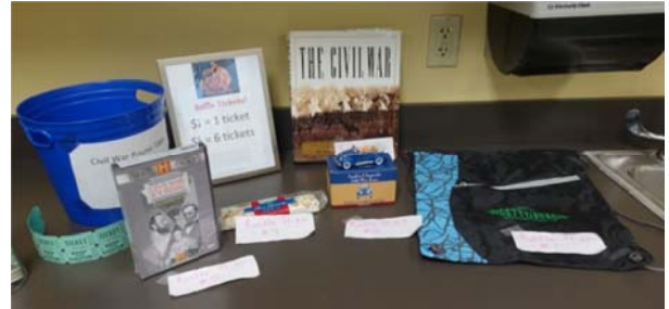
Typical of Monyhly Raffle Items at each Meeting