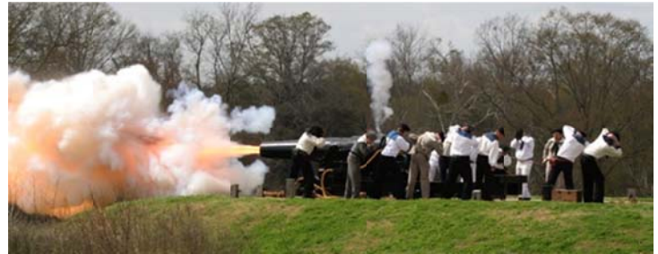
Firing a CSS Jackson Brooke Rifle

With the coming of the War in April, 1861, it was obvious that keeping lifelines open from the Confederacy to those who could potentially help from the outside was going to be critical. One of those lifelines was from the Chattahoochee/Flint River system in the deep South which exited into the Gulf of Mexico at Apalachicola, Florida. A major market route for cotton and mill goods from Alabama and