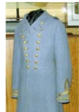
Catesby Jones Jacket, CSS Jackson

wood gunboat. This presentation will go into further detail on all these issues and include images of many of these sites and ships. The efforts to raise from the Chattahoochee River both the wood gunboat, CSS Chattahoochee , and the full size ultra-modern ironclad CSS Jackson from the Chattahoochee River will also be discussed.