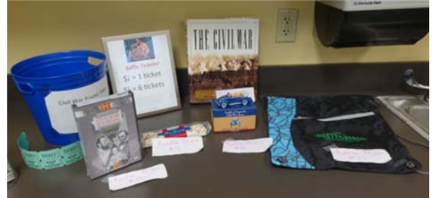
Typical of Monyhly Raffle Items at each Meeting