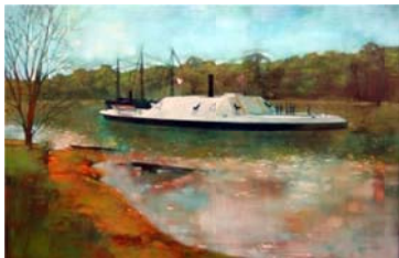
CSS Jackson w/Brooke Rifled Cannons

Georgia. One blockading ship arrived off Apalachicola in June of 1861 and then two by August. One way to keep all the river ways open in the South was to create Confederate Navy ships to negate the US Navy efforts from the rivers and bays in the South. A large Navy construction yard was built in Columbus, GA, but the first efforts to defend the Chattahoochee River was the creation of a small Navy Yard in Saffold, GA and begin construction on