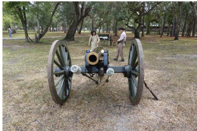
Confederate 12 pdr Napoleon & Crew, Otter Springs Reenactment