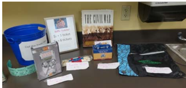
Typical of Monthly Raffle Items at each Meeting