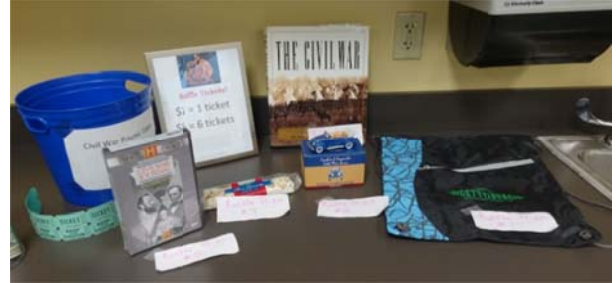
Typical of Monthly Raffle Items at each Meeting