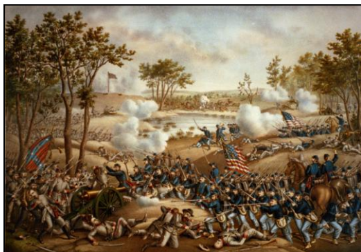
Battle of Cold Harbor by Kurz and Allison, 1888